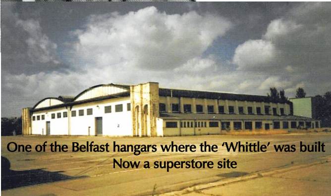
One of the Belfast hangars where the 'Whittle' was built Now a superstore site