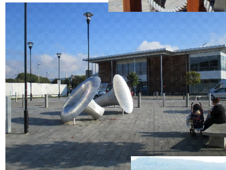
Sound Trumpets in Whittle Square Hear the factory at work!