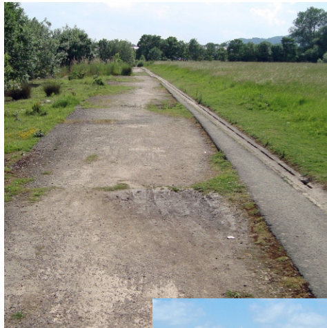
Remains of the runway