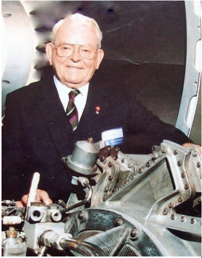
Sir Frank Whittle Inventor of the jet engine