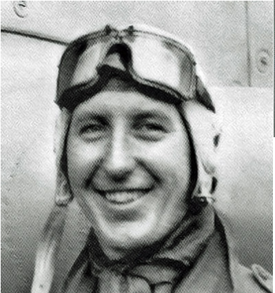
Gerry Sayer OBE Gloster test pilot for first flight